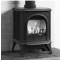
Huntingdon 20 with Clear Door