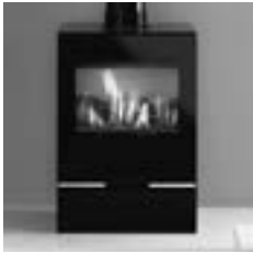
Gas Vision Midi