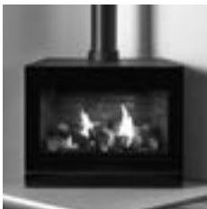
Riva2 F670 Glass

See page 15 - 16 for balanced flue options