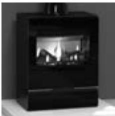
Gas Vision Medium