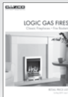
Logic Gas Fires & Fire Baskets