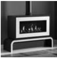
Studio 2 Freestanding