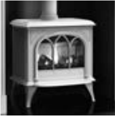
Huntingdon 40 with Tracery Door