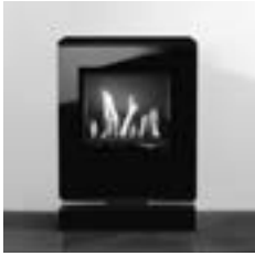
Gas Vision Small