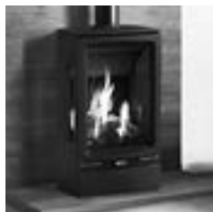
Gas Vogue Midi T

*When used with Programmable Thermostatic Upgradeable remote control (8456)