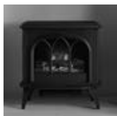
Electric Huntingdon 40 with Tracery Door