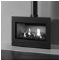
Riva2 F670 Steel