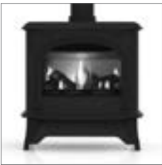
Huntingdon 40 with Clear Door