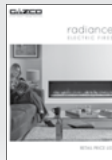
Radiance Electric Fires