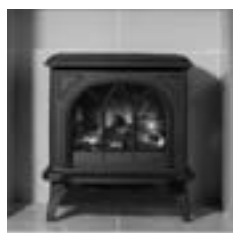
Electric Huntingdon 30 with Tracery Door