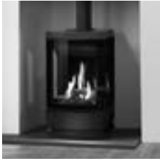
Loft with Plinth