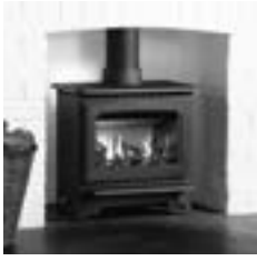
Medium Gas Marlborough2

Energy Efficiency Class List Price £ excl. VAT Suggested Retail Price £ incl. VAT