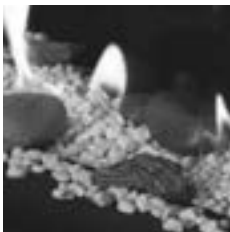
PEBBLE & STONE