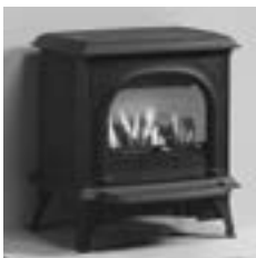
Huntingdon 30 with Clear Door