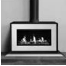
Studio 1 Freestanding