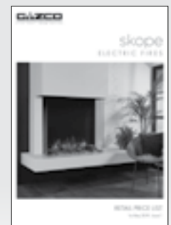
Skope Electric Fires