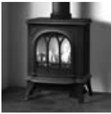
Huntingdon 20 with Tracery Door