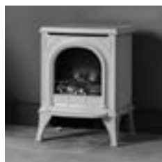
Electric Huntingdon 20 with Clear Door