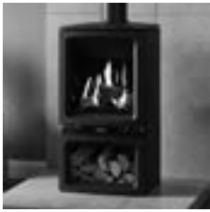
Gas Vogue Midi Midline