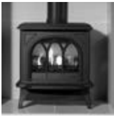
Huntingdon 30 with Tracery Door