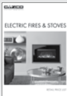
Electric Fires & Stoves