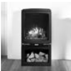
Vogue Midi Midline Electric