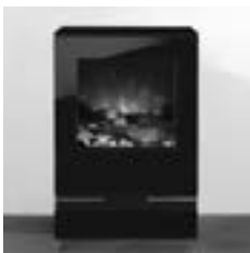
Electric Vision Small

See page 15 - 16 for balanced flue options