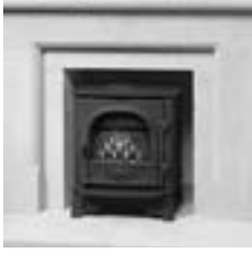
Gas Stockton 5

Energy Efficiency Class List Price £ excl. VAT Suggested Retail Price £ incl. VAT